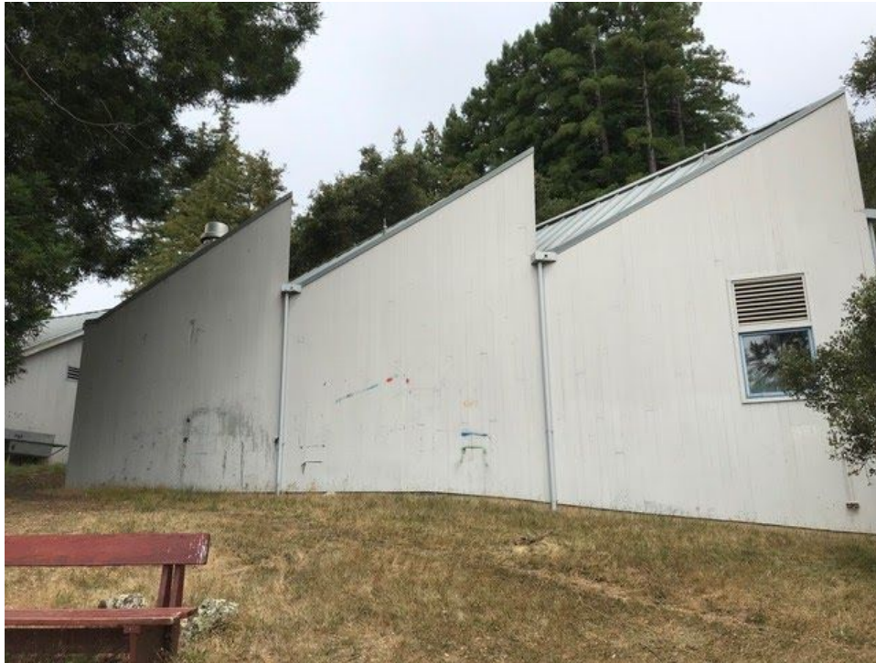
Desired mural space

Klytie Xu klytie@ucsc.edu 6503023659 UCSC 2021