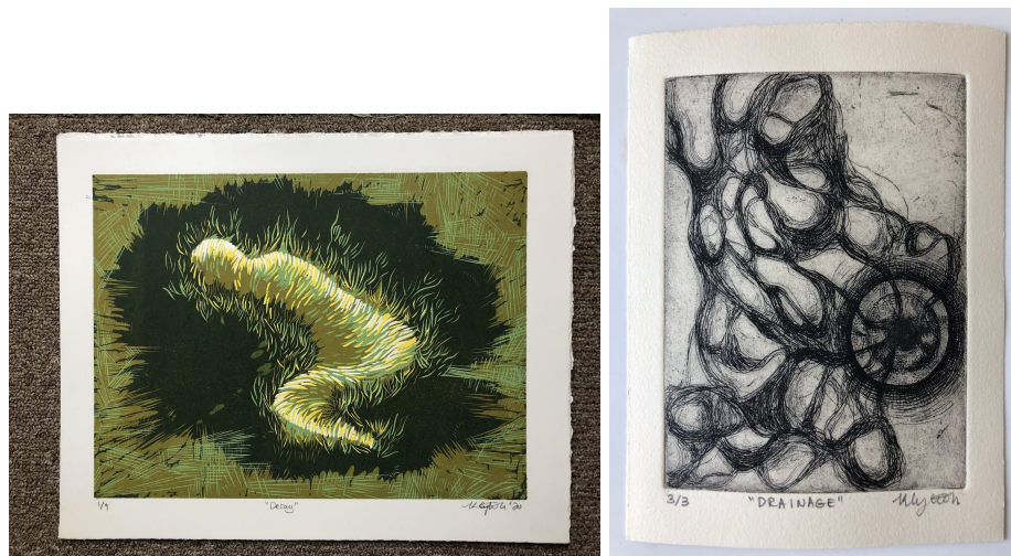
Klytie Xu, Relief print (left), Intaglio print (right)