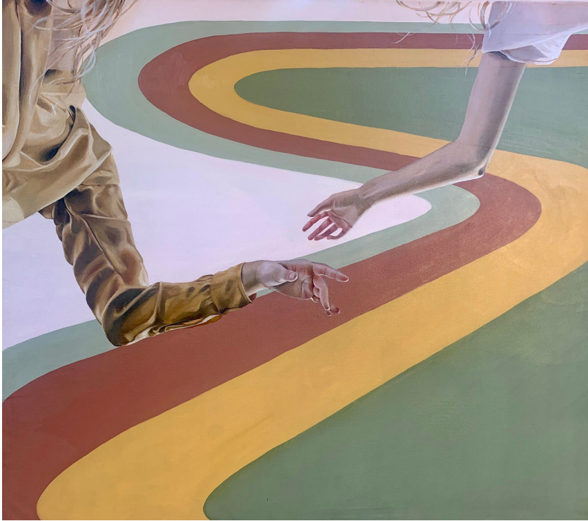
“46 x 49”- oil on canvas