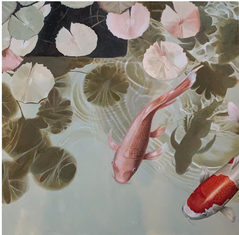
Top: "You Don't Get What You Don't Fight For"- 13' x 7'- Acrylic Bottom: 48"x48"- oil on canvas