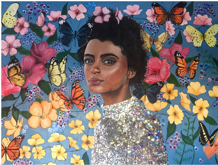
Top: Listen "To Our Women", 13'x8' -Nails, screws, woodstain, goldleaf, acrylic on wood Bottom: "I'm Living", 12'x 8'- Acrylics and broken CD's on canvas