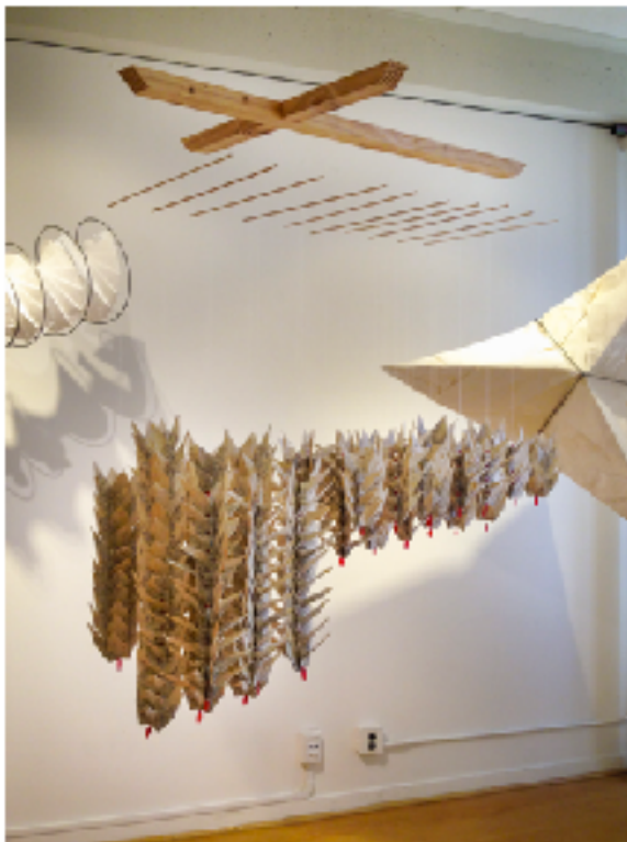
Thoughts and Prayers (2019)

As a returning student, I have completed many projects before and since re-enrolling in university. I am diligent, organized, and prepared to work on this commission. My education at UCSC has focused on the construction of sculptures of varying sizes and materials. My latest sculpture class had me how to easily create molds at home; the process consisted of sculpting clay, casting the clay with a silicone mold (with a plaster support), then pouring the concrete into the silicone mold. Hanging apparatus could then be placed in the back of the wet concrete. A simple concoction of moss and lichen can then be cultivated onto the dried lettering. This project would allow for a challenge in utilizing a space that will once again be filled with students. I am committed to seeing this project through as it is a manifestation of my own legacy.