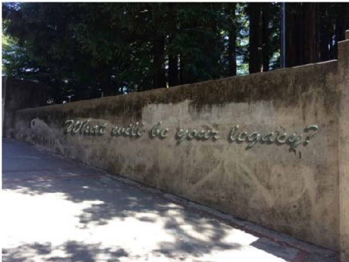
Thimanns short & long ramp wall